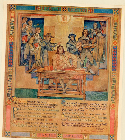
above & right: The Divine Laws are foundations of moral integrity in which law and order is the glorious vision of God and humanity. William Penn's 1701 Charter of the City of Philadelphia outlined secular laws for community conduct.