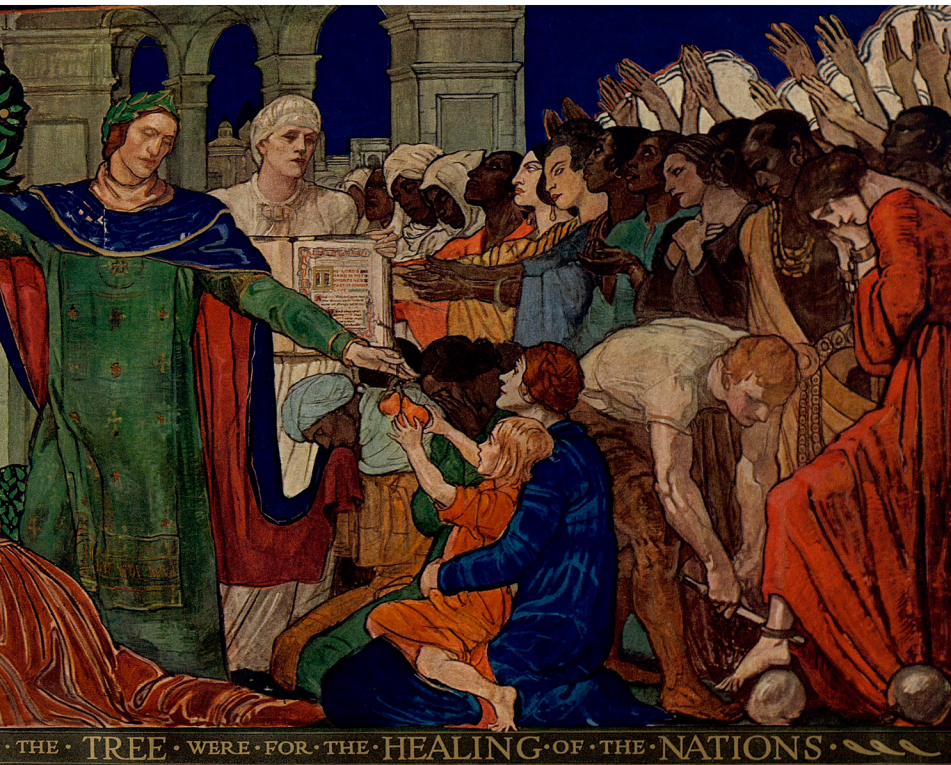
THE TREE WERE FOR THE HEALING OF THE NATIONS