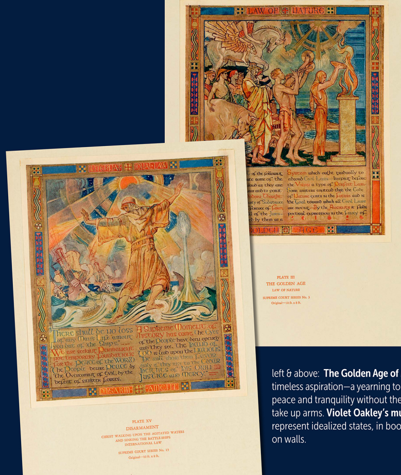
left & above: The Golden Age of Mankind is a timeless aspiration—a yearning to accomplish peace and tranquility without the need to take up arms. Violet Oakley's murals often represent idealized states, in books or on walls.